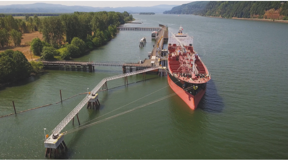
The S.S. Bochem London docked at the Port Westward terminal.