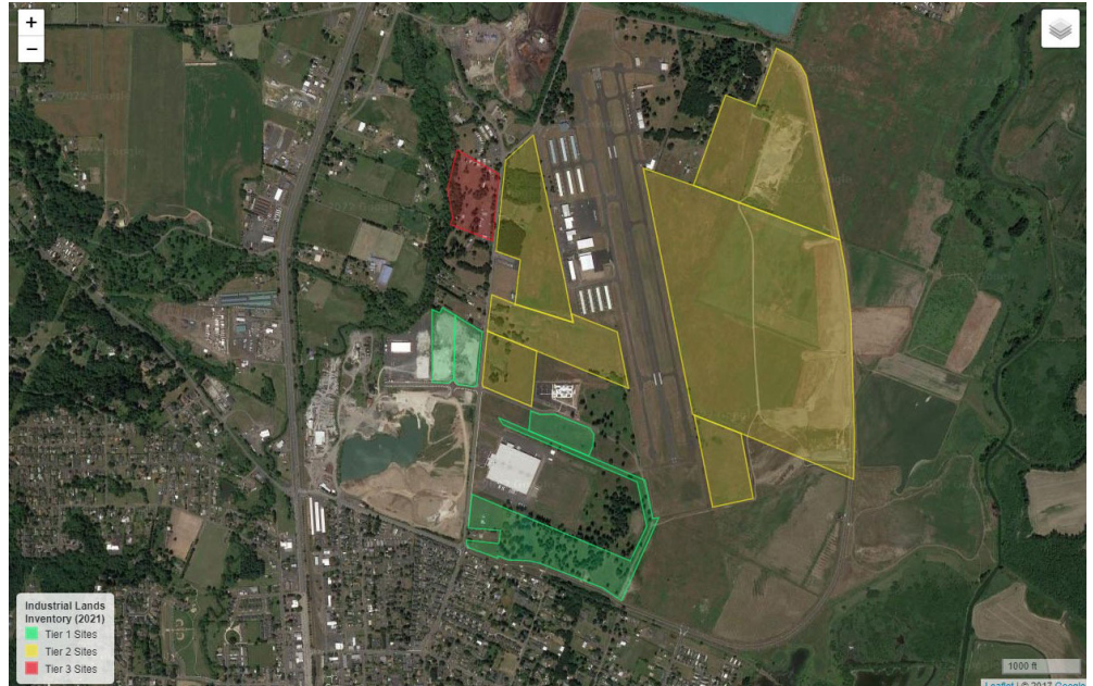
An interactive map of Columbia County's Industrial land is available on the Port's website.

The full report and a map of the county's industrial land is available online. Visit www.portofcolumbiacounty.org and click on 'Business & Development' to view the 'Columbia County Industrial Land Inventory.'