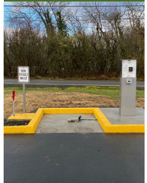
On site RV Dump Station at the Bayport RV Park & Campground.

A new RV dump station is now available on-site at Bayport RV Park. A welcome addition to the RV park, this amenity is available to the public for $15.00 (credit cards only).