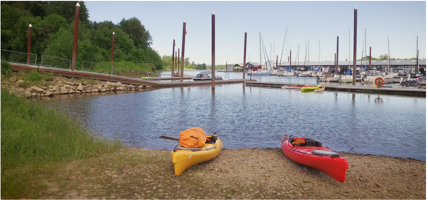
Kayaks at Scappoose Bay Marina. Marina improvements will include a kayak beach launch.